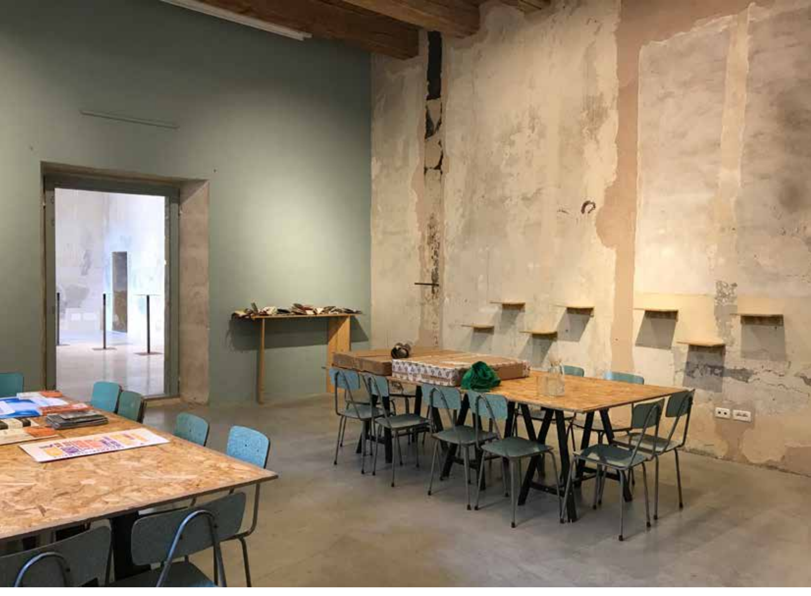
Casermarcheologica classroom and installation room